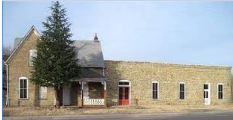
Photographs, Top Row, L to R, Goddard Hall at New Mexico State University, Anton Chico Land Grant Bottom Row, Acequia within the San Antonio de Las Huertas Land Grant, Silver City Waterworks