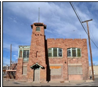
Photographs, CPRF Round 1 Awardees, Top Row, L to R, City of Santa Fe, Main Library; City of Deming, Luna Mimbres Museum Bottom Row, Town of Silver City, Silver City Waterworks; State Land Office, Dinetah Pueblitos; City of Albuquerque, Albuquerque Rail Yards Fire House